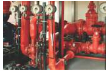
Civil Defense Approved System