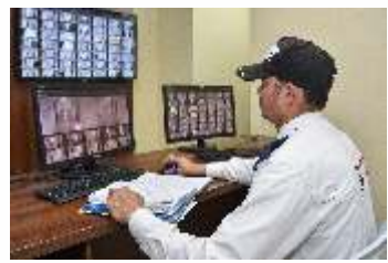
24/7 CCTV Surveillance