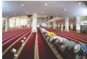
3 Large Mosques with a Capacity of 10,000 People