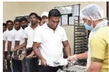
Separate Mess Hall on Each Floor