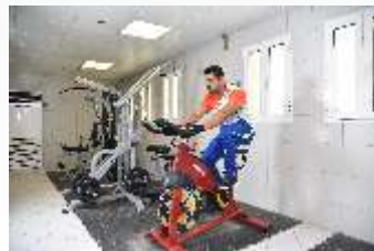
Health and Recreation Facilities