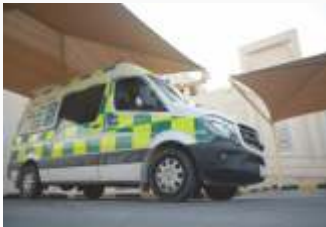
24/7 Ambulance service