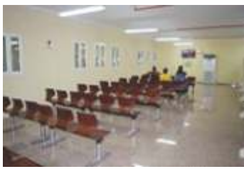
Entertainment & Relaxation