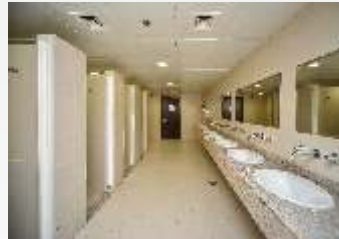
Separate Showers and Toilets