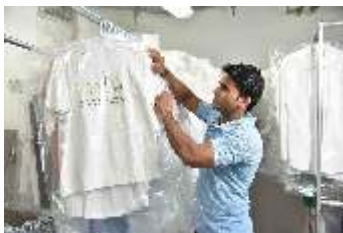
All Type of Laundry Services Available for Staff and Workers