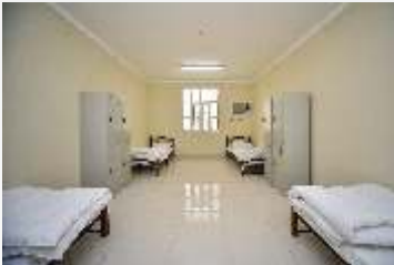
6 X 4 m 2 Rooms